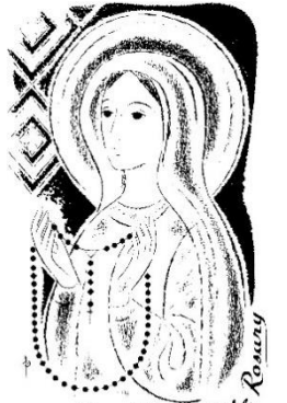
Our Lady of the Rosary