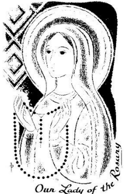
Our Lady of the Rosary

11 Harvington Close, Wellington, TF1 3EX Tel: 07926 044405