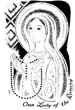
Our Lady of the Rosary