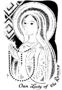
Our Lady of the Rosary