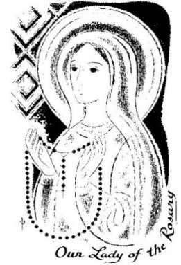
Our Lady of the Rosary